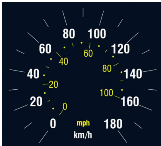
Figure 3: Example of km/h and mph DMI speed display